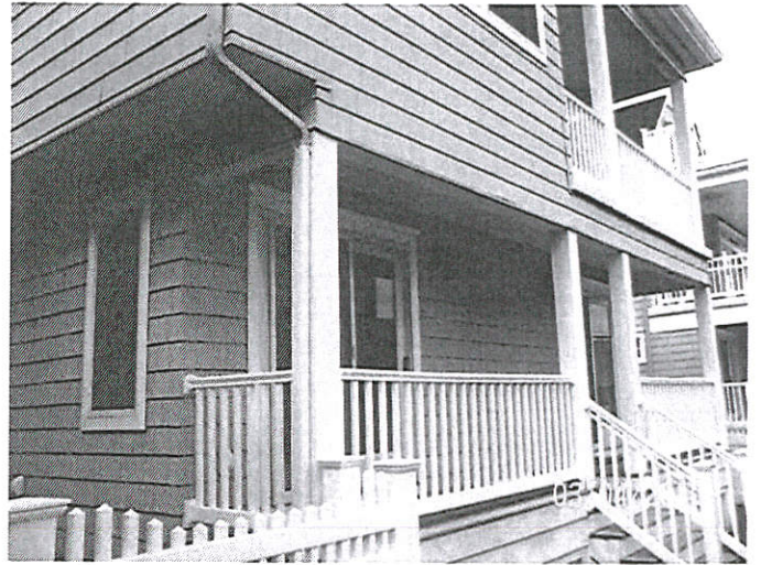
Front View – Date of Photograph: (See Photo Stamp)